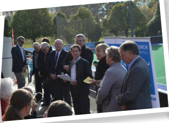
$2 million in sports recovery grants are helping: to construct a new hockey turf; build temporary facilities for Canterbury rowing clubs; repair 14 Christchurch bowling greens; repair Christchurch cricket grounds.