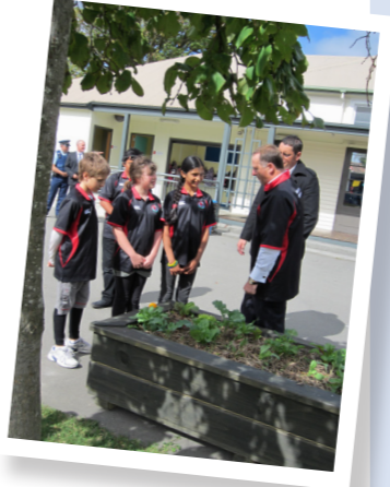
Appeal funds have almost doubled KiwiSport programmes in eastern suburbs. Prime Minister John Key visited Christchurch East School to take a look.