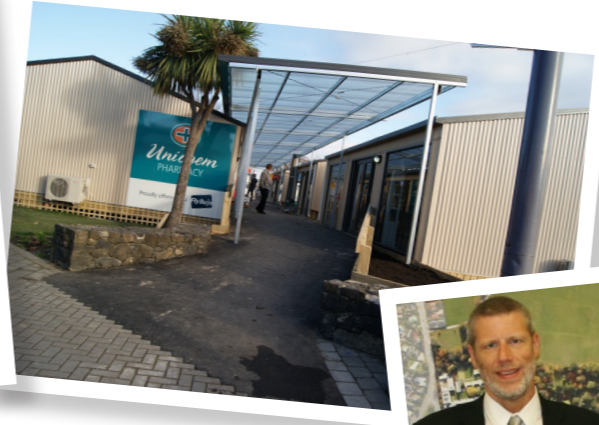
Temporary buildings in Rangiora and Kaiapoi are helping to keep local businesses in town, while Appeal funds are providing public amenities such as lighting and walkways.