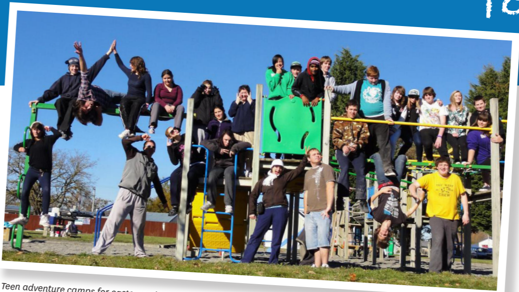
Teen adventure camps for eastern suburbs and Hornby teenagers (one camp per term) are being run in 2012 with support from the Vodafone Foundation Canterbury Fund - jointly funded by the Appeal Trust and Vodafone Foundation. Hurry! Funding applications close 6 July 2012 for the Vodafone Foundation Canterbury Fund.